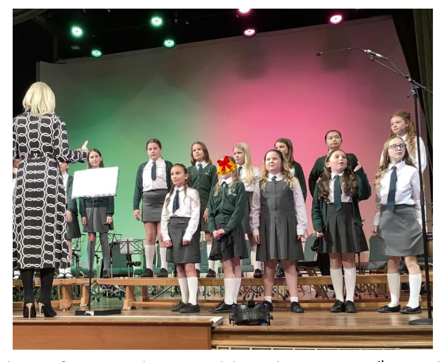
Year 6 Choir performing at The Rotary Club Carol Concert on 13th December 2022.

The end of last term saw many Christmas events, celebrations, productions and some lovely snow! We would like to thank our families for their fantastic support with all of the end of term events including; Reception Carols, Year 1 Nativity, Year 5 Fashion Show, FOLPS Christmas Fair and the Rotary Club Concert (to name a few).