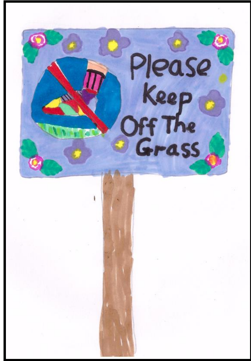
Making signs to remind people to not walk on the grass.