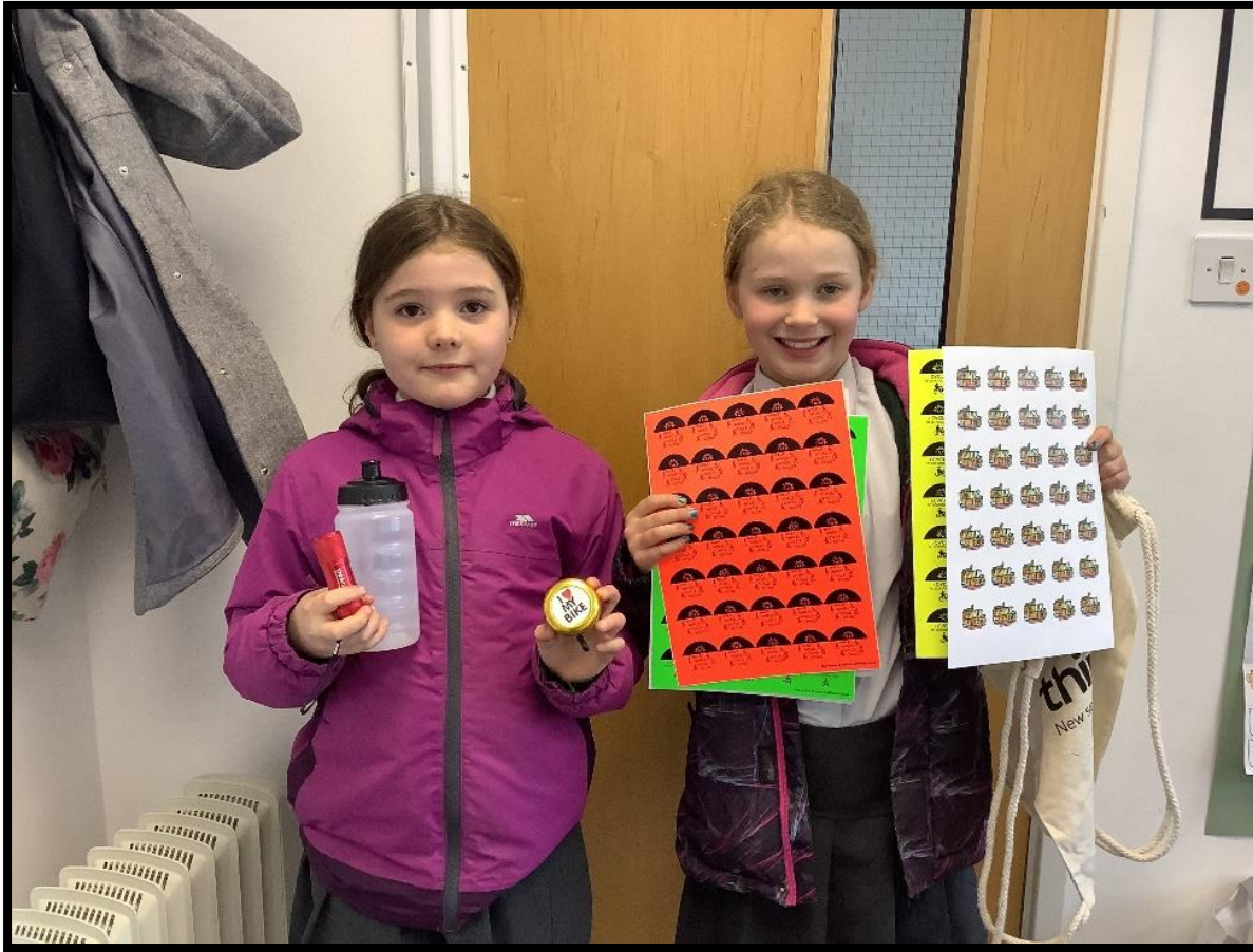
Entering the school into Sustran's Big Walk & Wheel Event and collecting up data.