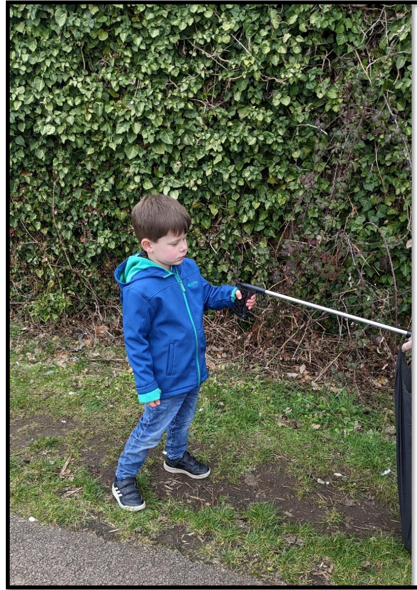
Litter-picking and taking care of wildlife at home.